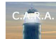
Coalition Against Rape and Abuse