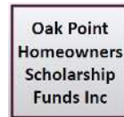
Oak Point Homeowners Scholarship Association Middleboro, MA