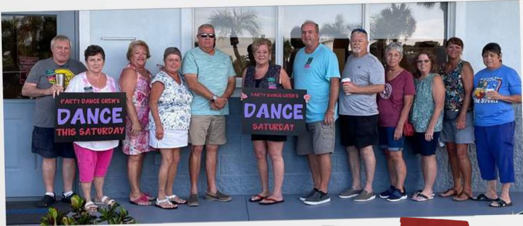
The Party Dance Crew of Tanglewood, in Sebring, FL, raised money to help meet the needs of children in Highlands County. The donations from residents and guests who attended these dances raised enough school supplies to help four elementary schools in the area.