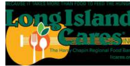
Long Island Cares Hauppauge, NY